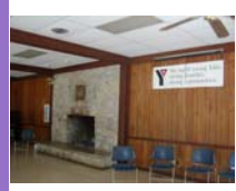
The wonderful fireplace inside the Clar-Art

Suitable for beginners or lifelong quilters, the Camp Willson Quilt Weekend is a great way to work on a