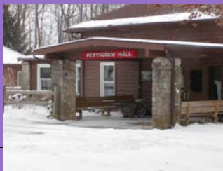
Pettigrew Hall in the snow. (Below)

YMCA Camp Willson 2732 County Rd. 11 Bellefontaine, Ohio 43311 Phone: 800-423-0427 Web: www.ymcacampwillson.org Email: conference@ymcacampwillson.org