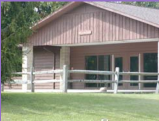
The Conference Center for the Quilting Weekend. (Above)

You will stay in modern, heated cabins with complete restroom facilities. (Bring your own bedding, towels, and toiletries.) We'll eat meals together in Pettigrew Dining Hall, where you will feast on some fantastic cooking from Dora and her crew.